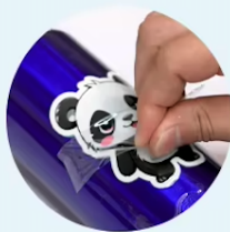
Tear off the Film B