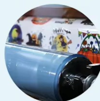
Cover with Film B