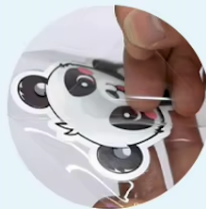
Tear off the Film A